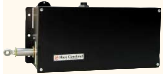
Hays Cleveland Model R-09500-B0 Draft Regulator

All models offer a linear damper drive with 6-inch range of travel, and 30 or 60 second nominal stroke time (providing 75 or 150 pounds starting thrust range, respectively). A powerful 72 RPM impedance-protected synchronous stepping motor positions a drive tube over a linear range of travel. Inward and outward end switches shut off power to the motor whenever the drive tube reaches the fully extended or fully retracted position. On sequencing models, an additional switch signals the burner management system that the damper is open, as required by codes. There is no hunting or overheating under even the most unstable process conditions.